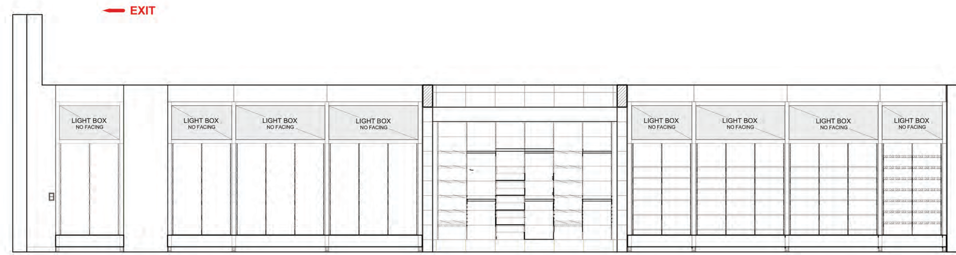
1 NORTHWEST WALL Scale: 1/4" = 1'-0"