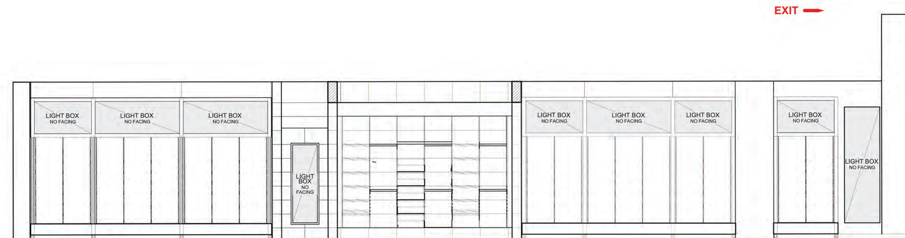
3 SOUTHEAST WALL Scale: 1/4" = 1'-0"