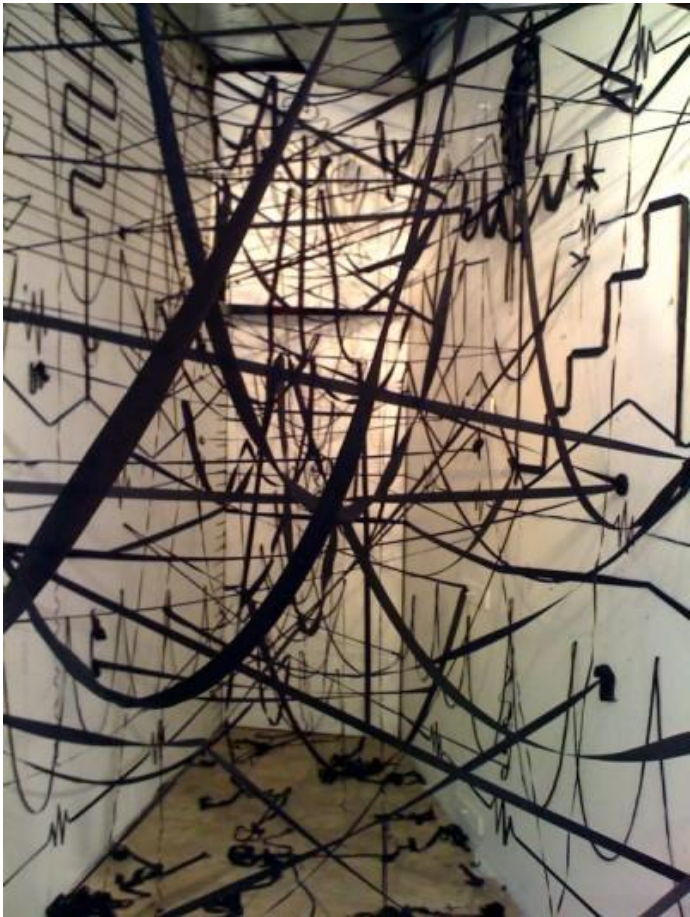
A wild scene in the window at end of today August 18, by infinity