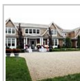
The Annual Hampton