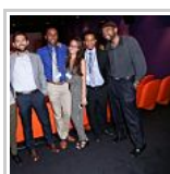
Camp Interactive continues to