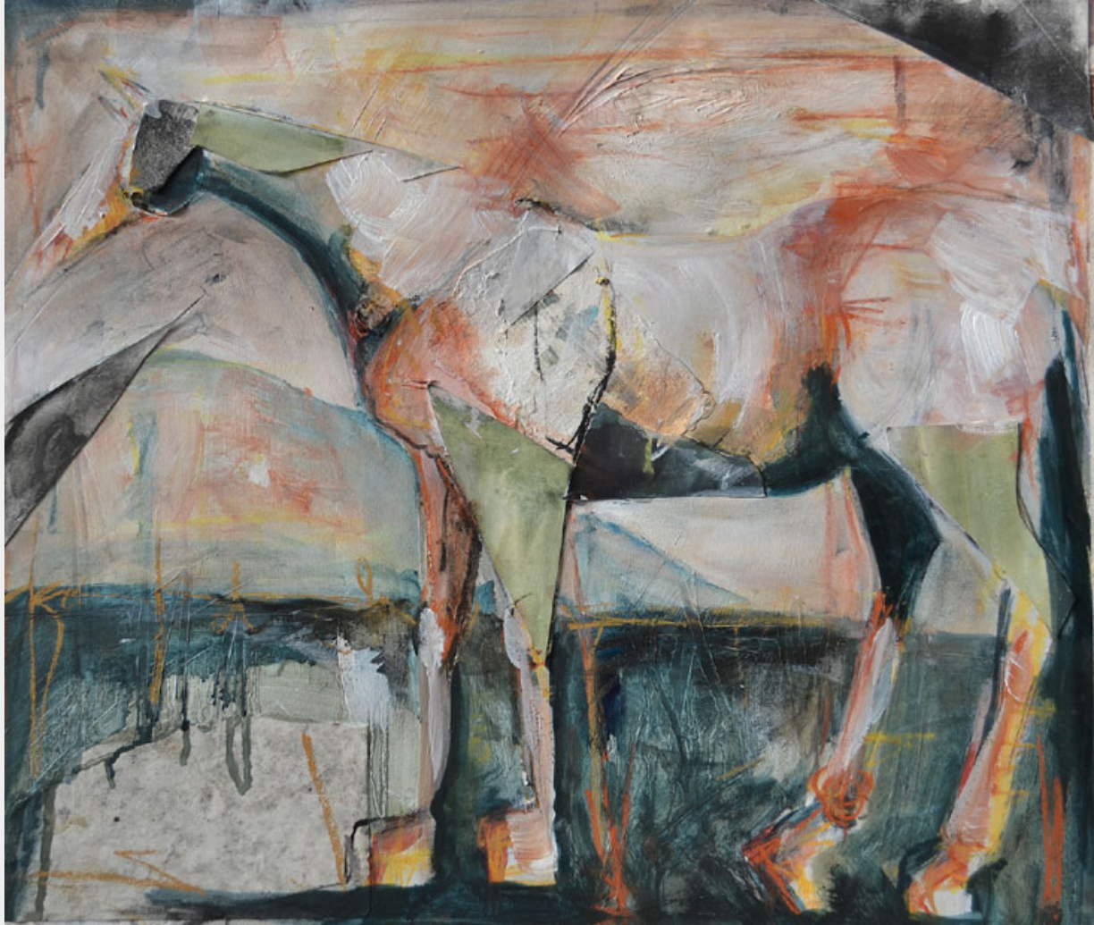
Syd Glasser, A Horse For Basquia, Collage and Mixed Media, 16 x 20