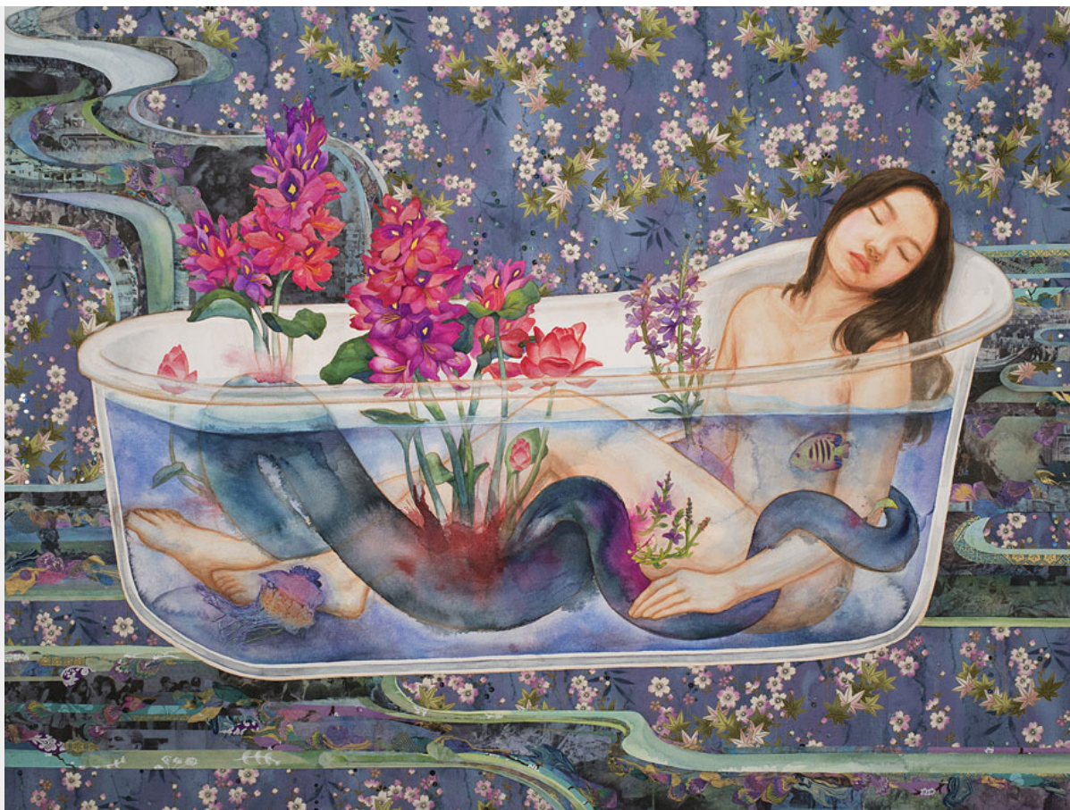
Suyeon Na, Flow, watercolor, gouache, collage on paper, 2015, 36x48