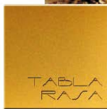
TABLA RASA GALLERY 224 48TH ST., BROOKLYN, NY 11220