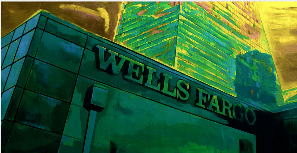
Carl Auge, Brown Sky, oil on canvas, 2009, 40x80